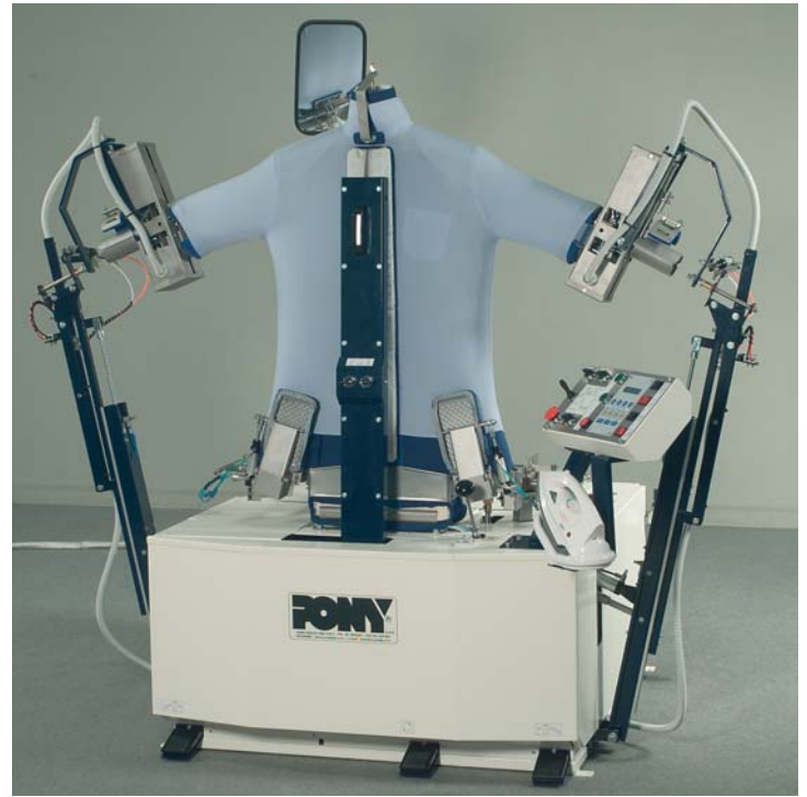
Pony MG405 Shirt former

The model chosen by the Dorchester was Renzacci's Progress 30 Club, widely regarded as the Rolls Royce of the Dry cleaning world. Final comment goes to Paul, who is delighted with the installation: "I'd like to comment on the professionalism and competence of Renzacci. They were able to schedule the installation very promptly and it proceeded seamlessly right through to the staff training. The acid test is that the machine is performing perfectly to our total satisfaction."