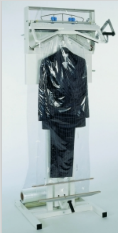
hp 630 KST-BS stand device, bottom sealer with manual operation

Bottom sealer, lower welding device with automatic operation via cable pull.