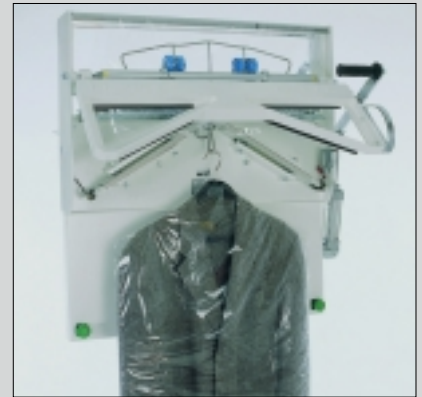
hp 630 KST-P... stand device with pneumatic operation also with bottom sealer

It works by pneumatic safety control with twohand tip-switch. The devices can also be operated manually.