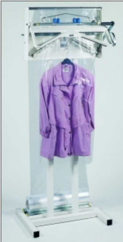
hp 630 KST stand device with manual operation

Cleaned clothes can easily be wrapped (with hangers) in order to prevent them from getting dirty or dusty again. You can determine the length of the package, therefore it is very cheap. Pull over the film, weld-ready packed !